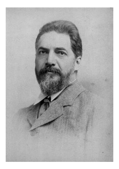
Figure 1: Sir William Matthew Flinders Petrie

British and international learned societies, Petrie remains a controversial figure due to his right-wing views on social topics and his belief in eugenics, see [19]. Upon his death, he donated his skull to the Royal College of Surgeons London, in particular, to be investigated for its high intellectual capacity in the field of mathematics, see [21].