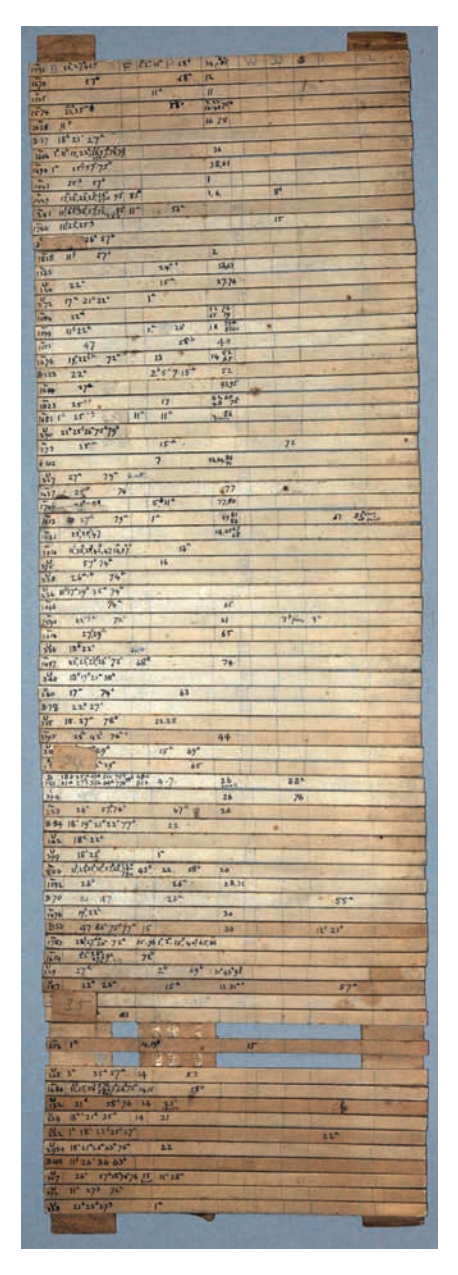
Figure 3: Paper-slips

the first entry is the individual alphanumerical code of the tomb represented by the slip. The following nine entries of the header slip contain the abbreviated names of Petrie's classification of pottery.